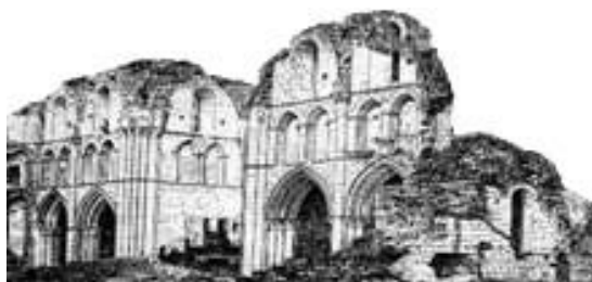
ROTHERHAM ARCHAEOLOGICAL SOCIETY

Rotherham Archaeological Society is a Registered Charity No. 504513